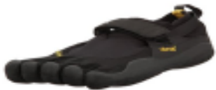
The "foot glove" type