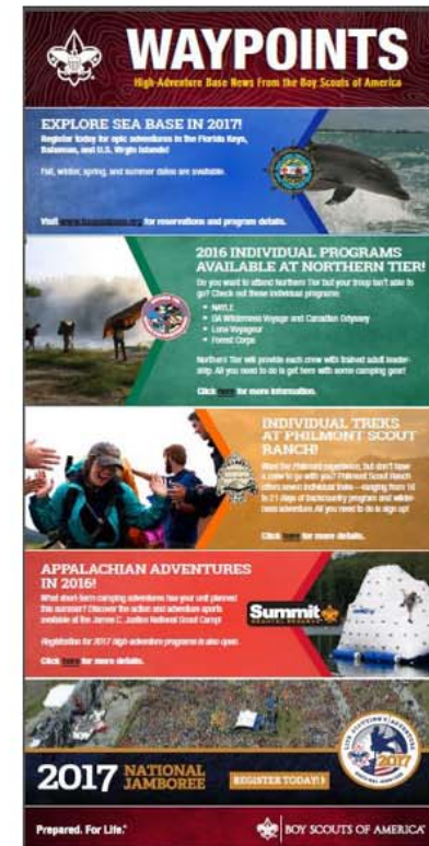
Waypoints March 2016