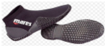
Aqua Shoes (scuba style or general store water shoe)

Recommended Footwear (must be closed-toed)