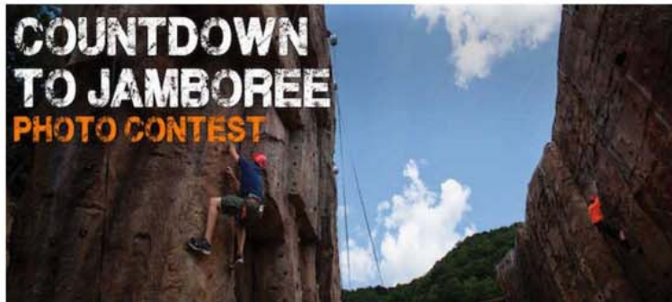
Scouting Wire, Social Media