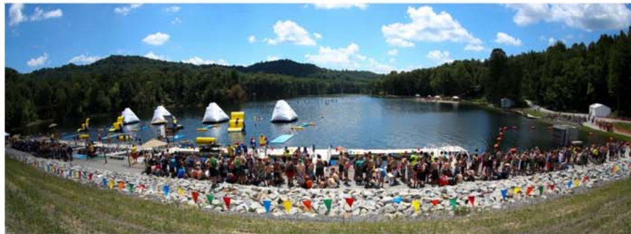
WATCH THIS VIDEO TO GET THE LOWDOWN ON THE 2017 JAMBOREE