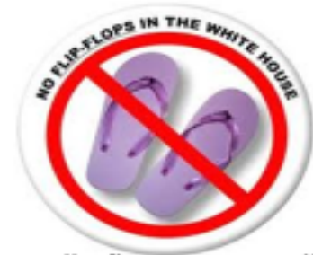
Flip flops are not allowed on the raft trip.