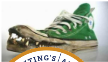
Old Tennis shoes are not recommended but they will work in a pinch. "Best of the worst"