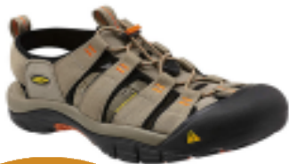
Open heeled and closed toed water sandal