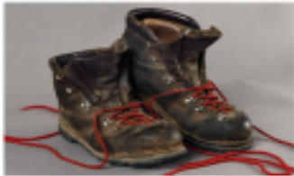
Hiking Boots (very difficult to swim in)