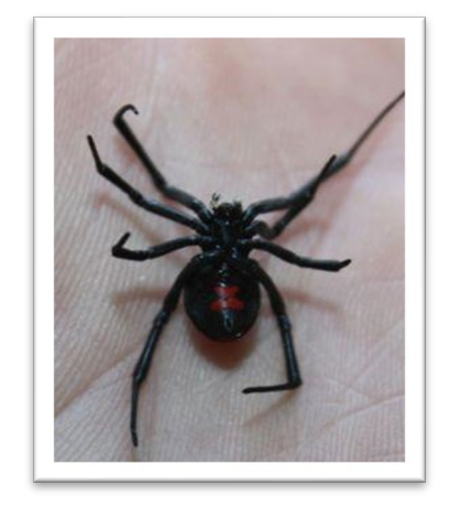
Black Widow Spider