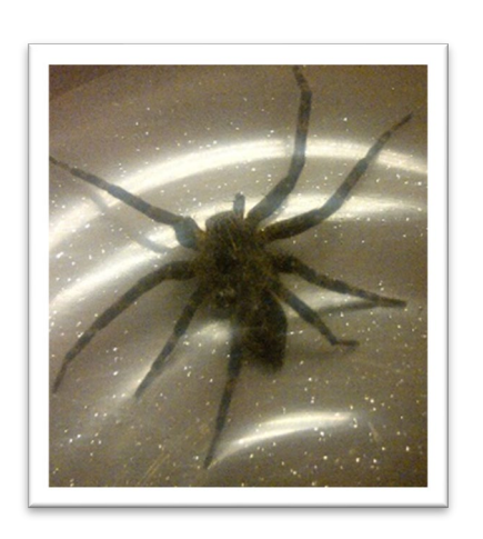
Brown Recluse Spider